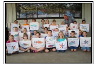
Sarasota Christian School 1st Graders with Fish Paintings.