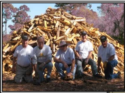
L: Wood splitters

Do you wonder that our volunteers will be sorely missed over the next eight months?